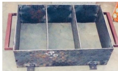
Fig 1: Mould for casting blocks(16*8*8)inches

Waste PET bottles of volume 250ml, 600ml and 750ml were collected from the surrounding area. The PET bottles were filled with soil, collected from a building demolition site. The tests such as specific gravity, sieve analysis, plastic limit, liquid limit, moisture content etc. were conducted to determine the properties of soil. Cement, M- sand and aggregates (6mm) were also collected and properties determined. To prepare solid blocks, an assembly of three moulds with conventional dimension 16*8*8 inches each was fabricated using mild steel sheet. The mould so prepared is shown in Fig. 1.